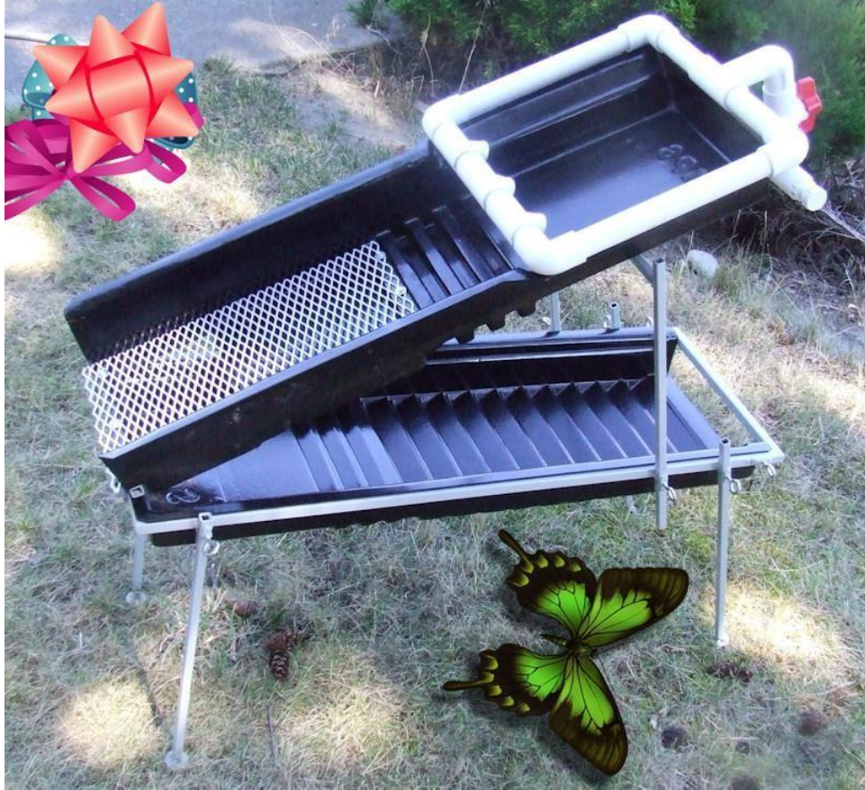
Black Scorpion Fine Gold Recovery Table & Concentrator Insert ( makes 2 'n' 1 system)